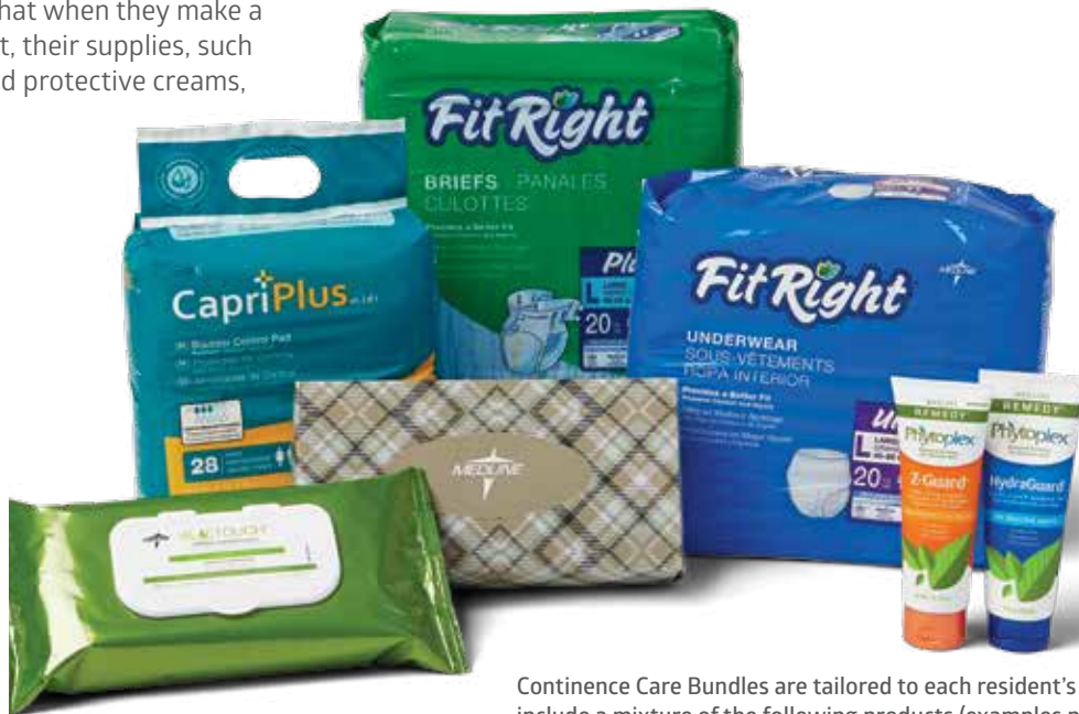
Continence Care Bundles are tailored to each resident's needs and include a mixture of the following products (examples pictured here): disposable liners, pads, protective underwear or briefs, exam gloves for caregivers, cleansing wipes and protective skin cream.