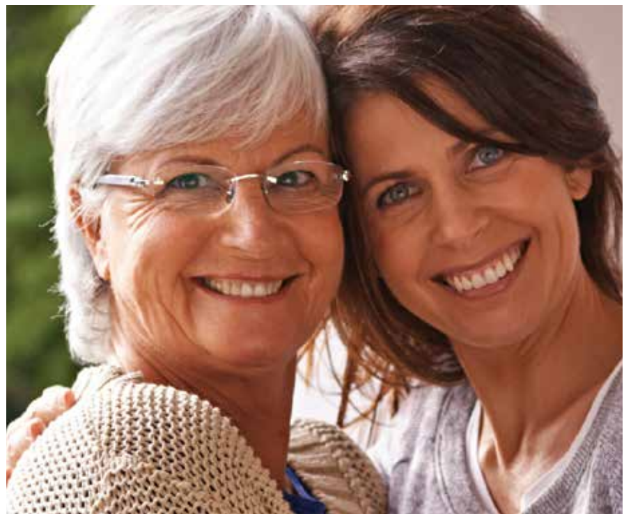
Benchmark Senior Living has more than 50 locations spanning the New England region offering a variety of services, including continence management.

Each bundle contains a 30-day supply of items unless the need for additional supplies was identified. What is great about working with Medline is that as a market leader, Medline provides a wide-range of high quality supplies, as well as clinical and product expertise. Equally important, Medline has the distribution and logistical capabilities to confidently service all of our 50-plus facilities throughout the New England region.